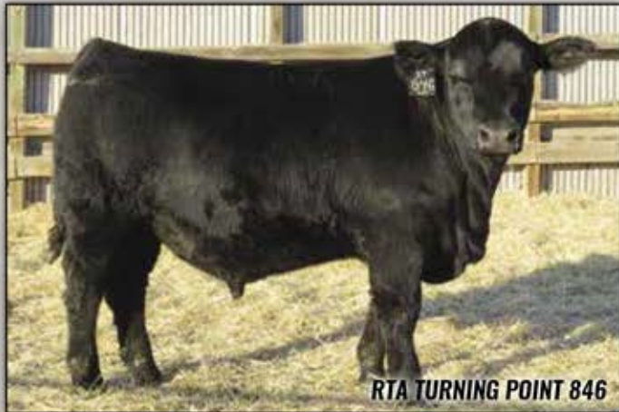
RTA TURNING POINT 846