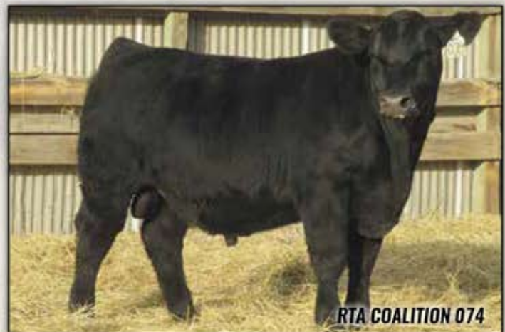
RTA COALITION 074

Throughout the catalog we have selected bulls we feel are definite calving ease and should be considered to use on heifers. These notes can be found in the footnote section of the lot boxes.