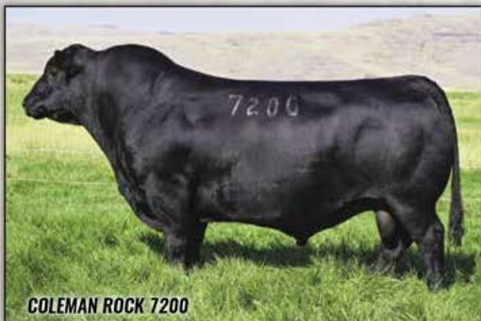
COLEMAN ROCK 7200