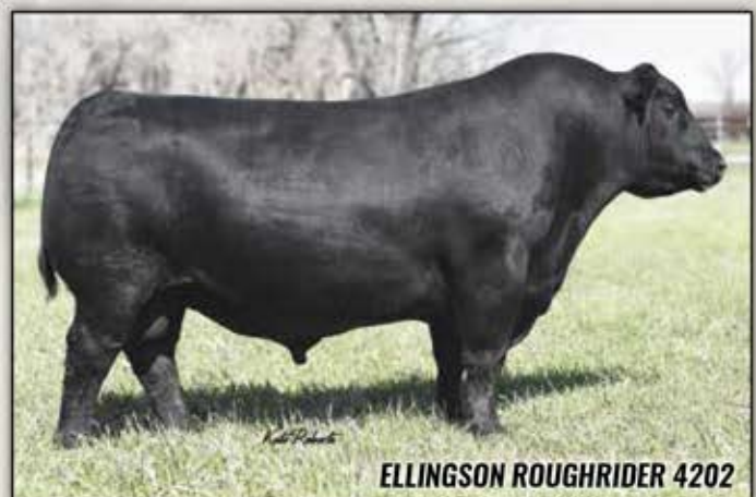
ELLINGSON ROUGH RIDER 4202