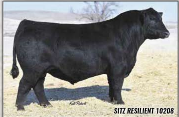
SITZ RESILIENT 10208