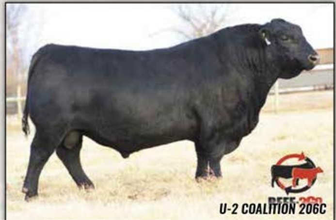
U-2 COALITION 206C