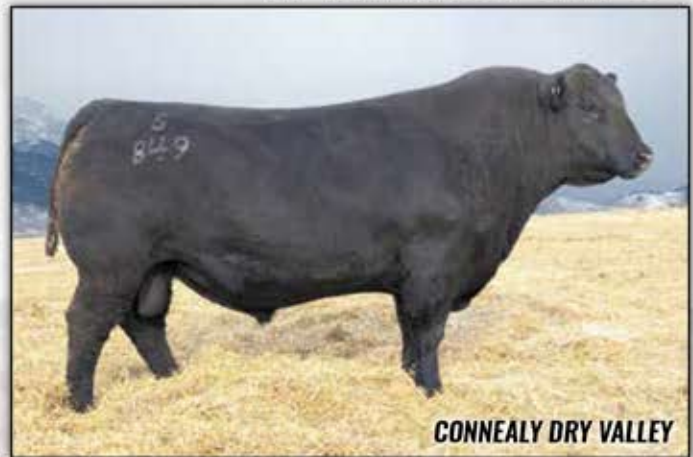
CONNELY DRY VALLEY