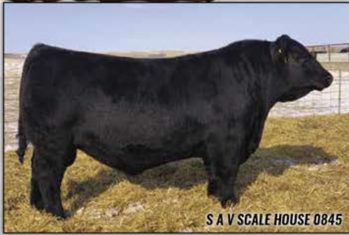
S A V SCALE HOUSE 0845