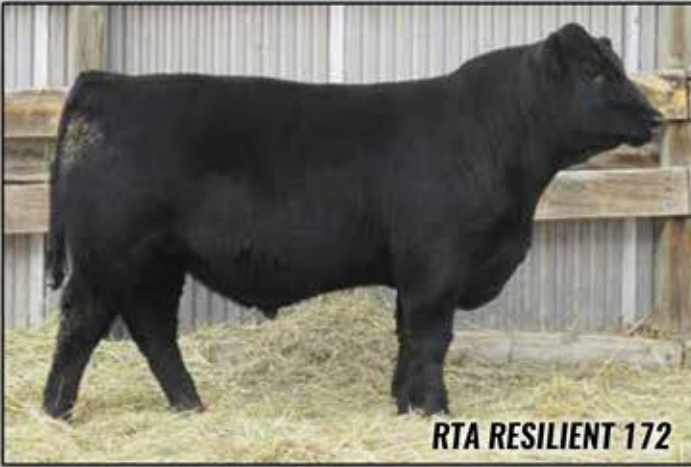
RTA RESILIENT 172