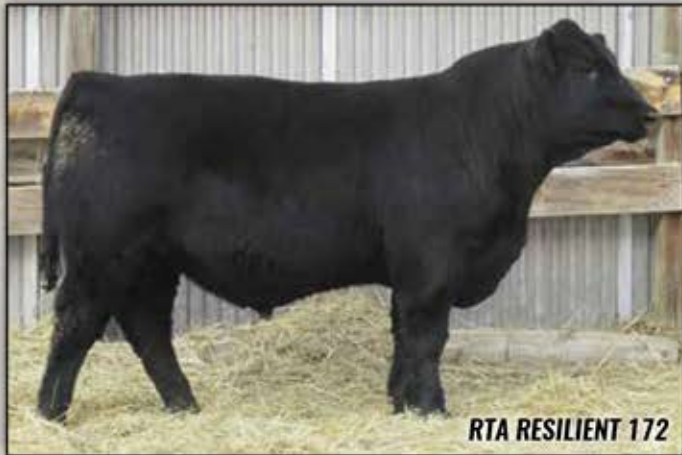
RTA RESILIENT 172